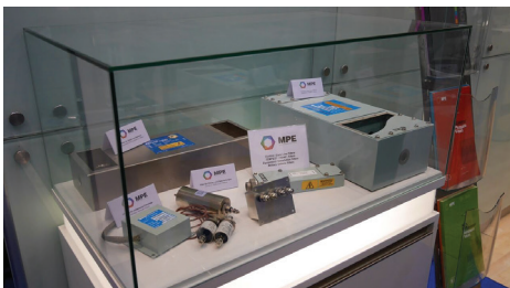
A cabinet on the stand displaying examples of MPE's filter and capacitor products